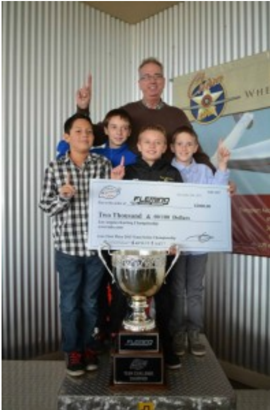
The Young Guns won the 2013 Dan Wheldon Excellence Team Championship